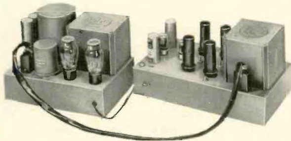
Left, the UTC W-20 Amplifier and Power Supply Kit, constructed according to instructions. Above, Fig. 1, performance data.

When constructed in accordance with the schematic, Fig. 2, the input signal required for 1-watt output is 0.32 volts at 1000 cps; for 10-watt output, the input signal is 1.12 volts. This permits full output power from conventional preamplifier-control units—most of which are capable of providing an output signal of approximately 2 volts without undue distortion. The input connection to the amplifier is through an Amphenol microphone connector, and connections to the speaker are available through a telephone jack. Output impedances ranging from 1 to 15 ohms may be obtained by suitable connections of the output transformer secondary.